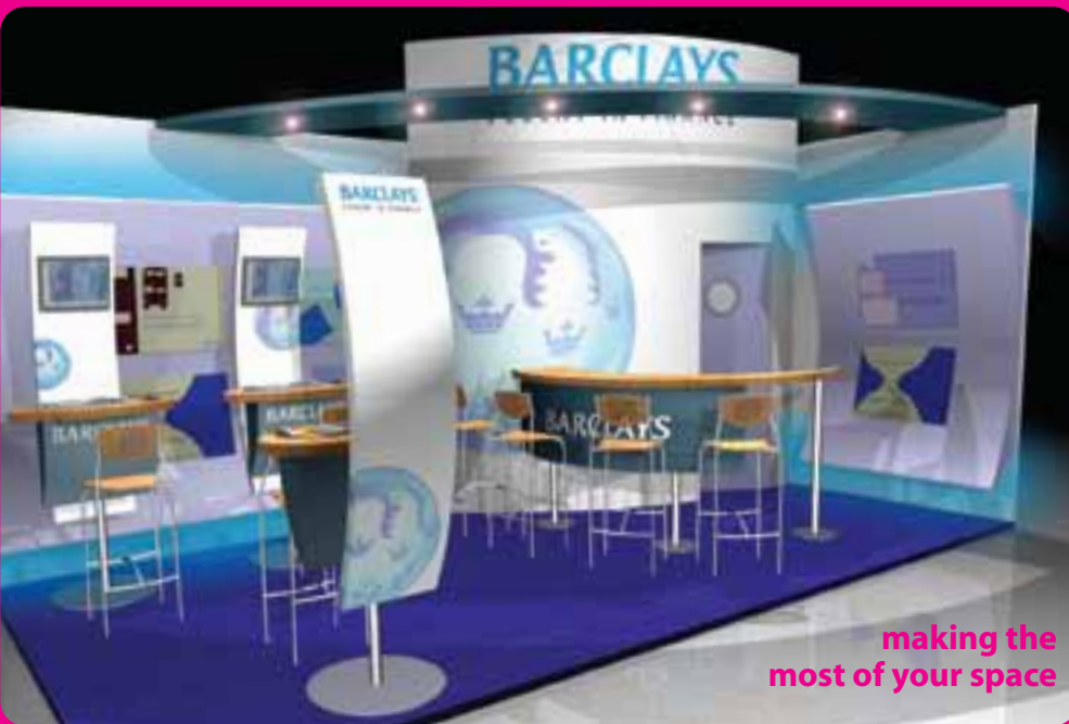
making the most of your space