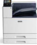
Xerox® VersaLink C9000 Color Printer