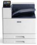
Xerox® VersaLink C8000 Color Printer