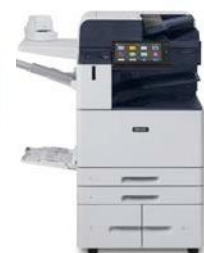
Xerox® AltaLink B8145/B8155/ B8170 Multifunction Printer

To learn more about Xerox® ConnectKey Technology, go to www.connectkey.co.uk .