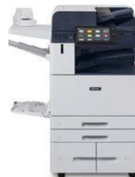
Xerox® AltaLink® C8130/C8135/ C8145/C8155/ C8170 Color Multifunction Printer