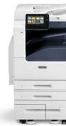
Xerox® VersaLink B7025/B7030/ B7035 Multifunction Printer