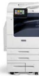
Xerox® VersaLink C7020/C7025/ C7030 Color Multifunction Printer