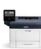
Xerox® VersaLink B400 Printer