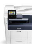
Xerox® VersaLink B405 Multifunction Printer