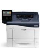
Xerox® VersaLink® C400 Color Printer